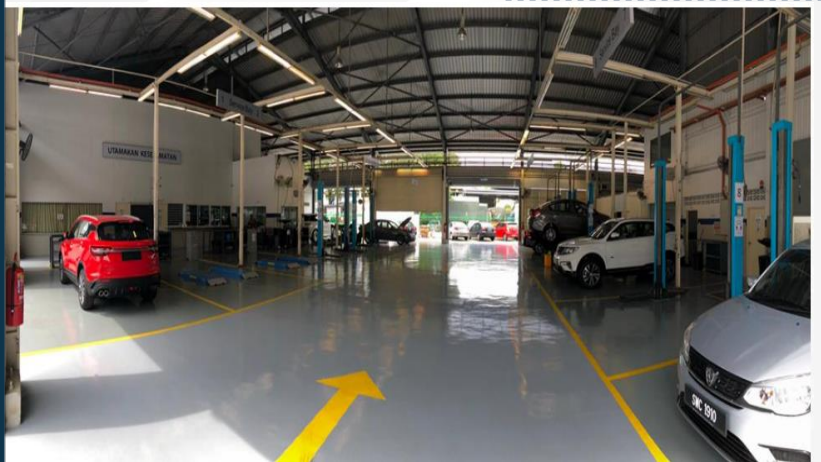
SERVICE REPAIR WORKSHOP