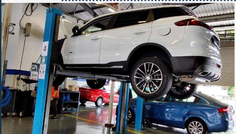
WORKSHOP WAORKING BAY

Proton Cahaya also provides the only authentic spare parts which are recommended and guaranteed by Proton for our customers. We always want our customer to experience the best driving moments with the guaranteed spare parts installed in order to protect the customers from getting defected parts.